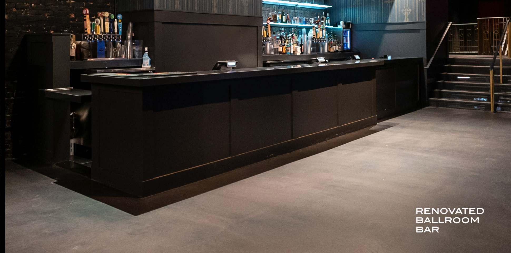
RENOVATED BALLROOM BAR