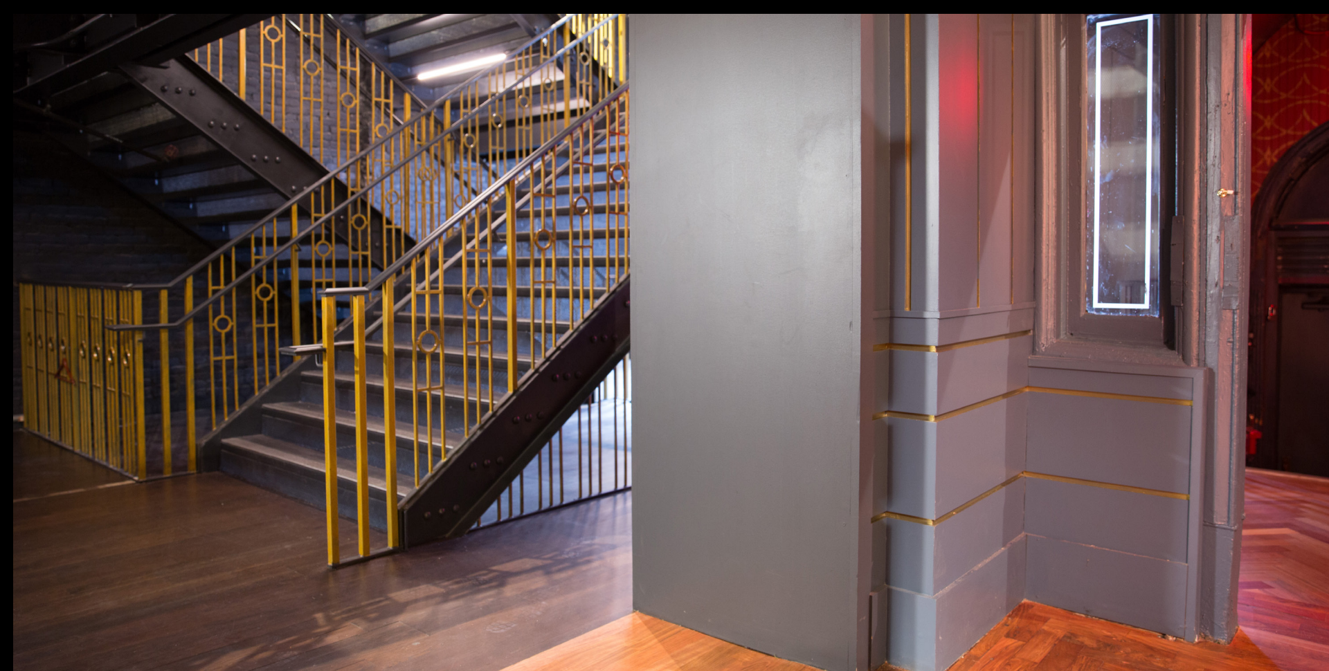
MODERN TOUCHES HIGHLIGHTING HISTORIC DETAILS